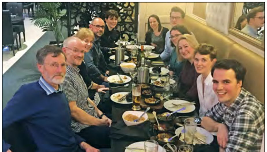
Some delegates relax in the evening