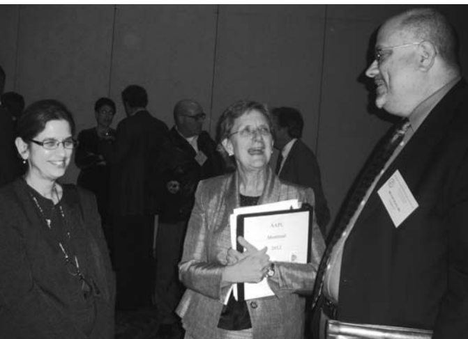
Conference participants catch up for a chat.