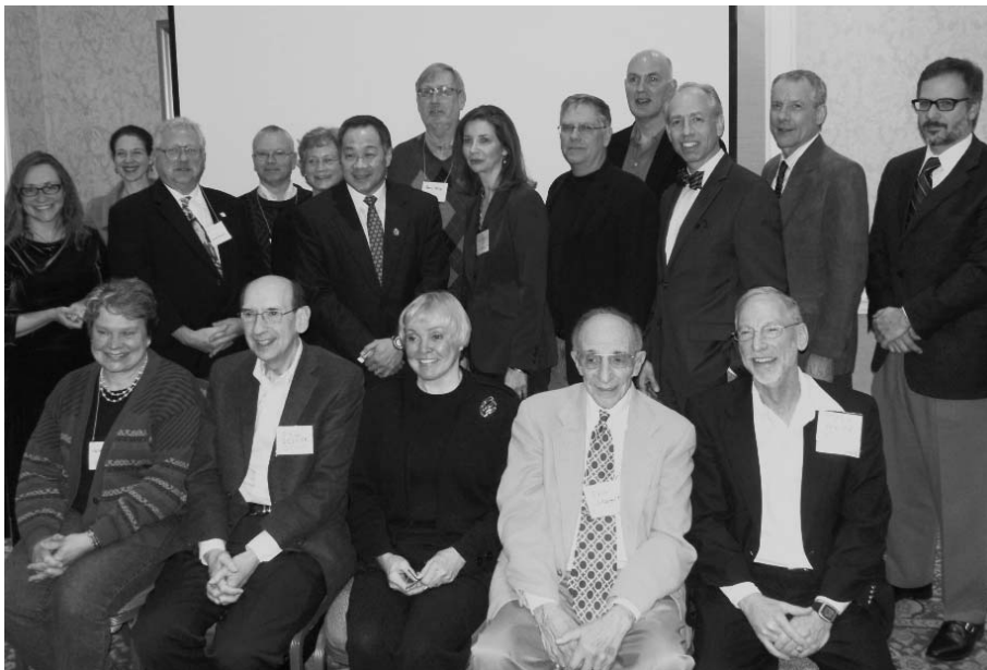
Past Presidents of Midwest AAPL.