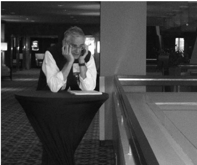
A rare moment of solitude and reflection to take it all in.