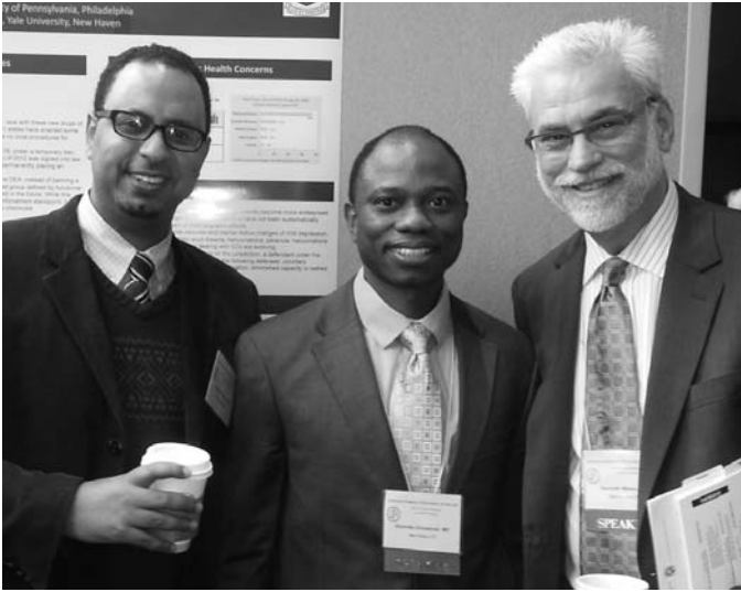
Authors/presenters pose in front of their poster.