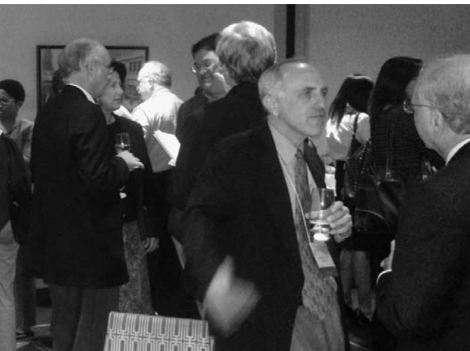
Chilling out at the Reception for conference attendees.