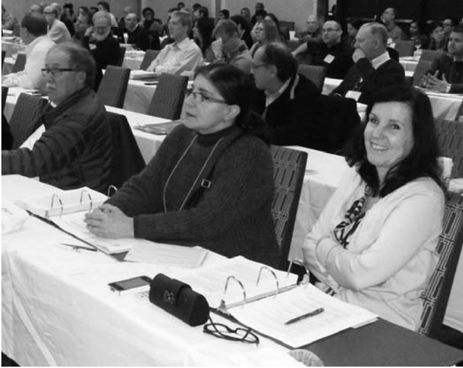
At the AAPL Review Course...