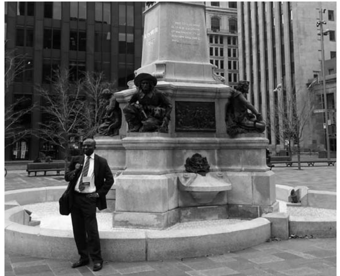
Newsletter Editor on a discovery tour of Old Montreal.