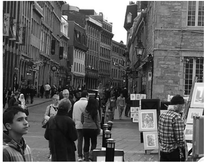
Old Montreal was a beehive of activity!