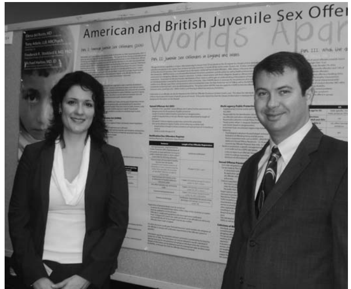
American and British collaboration.