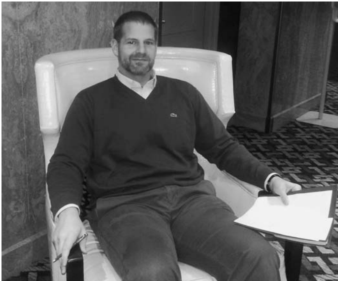
Waiting patiently for committee members to arrive for a meeting.