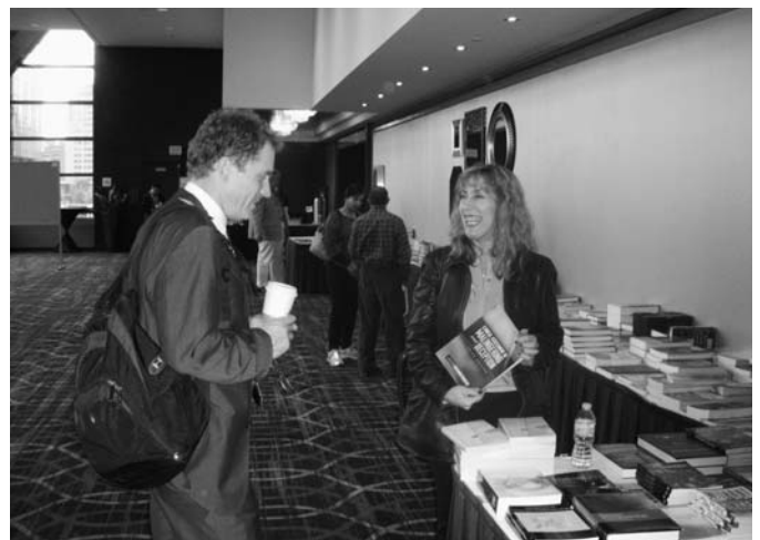
Sheer joy at finding a book at the book stand!