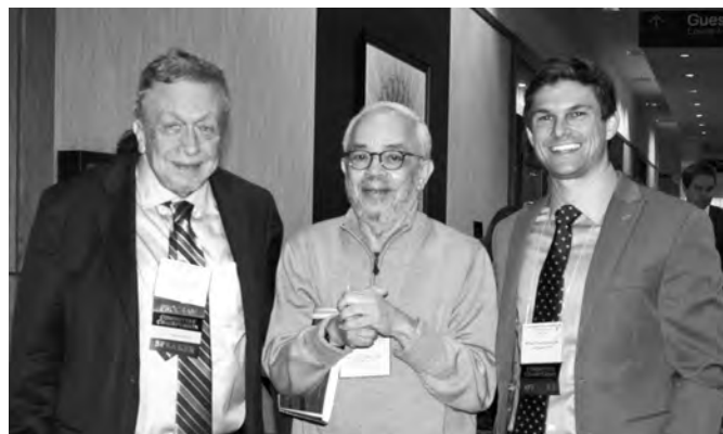
Catching up with colleagues