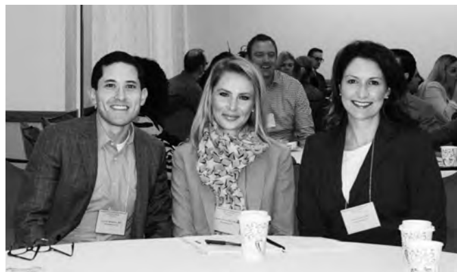
ECP's: The future of AAPL