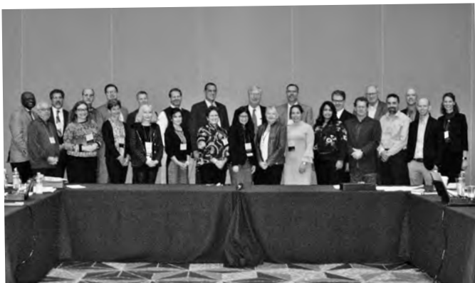
AAPL's Governing Body, the Council