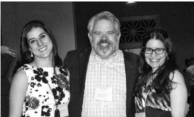
Unwinding at the Friday night reception for all attendees