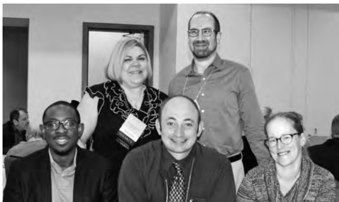
ECP's: The future of AAPL