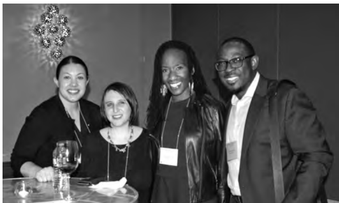
Attendees enjoy the Thursday night ADFPF reception