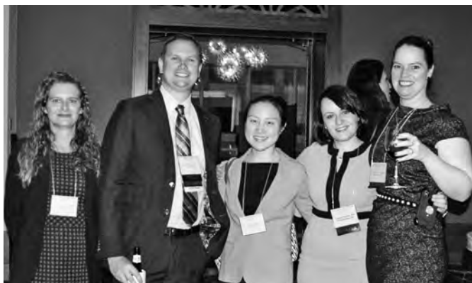
Attendees enjoy the Thursday night ADFPF reception