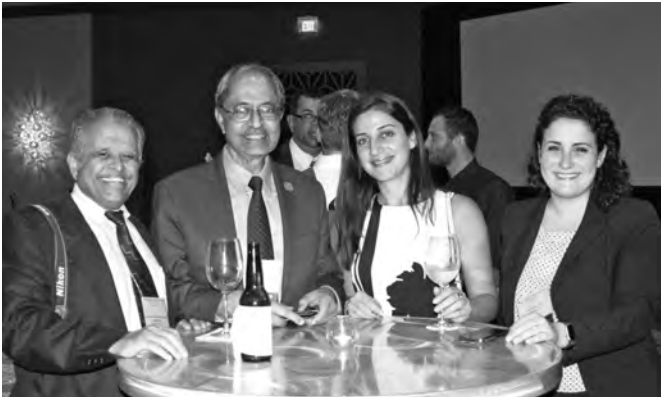
Unwinding at the Friday night reception for all attendees