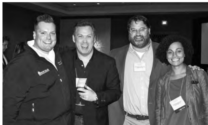
Attendees enjoy the Thursday night ADFPF reception