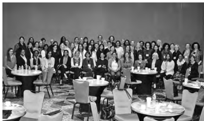
Strong turnout for the WAAPL Reception