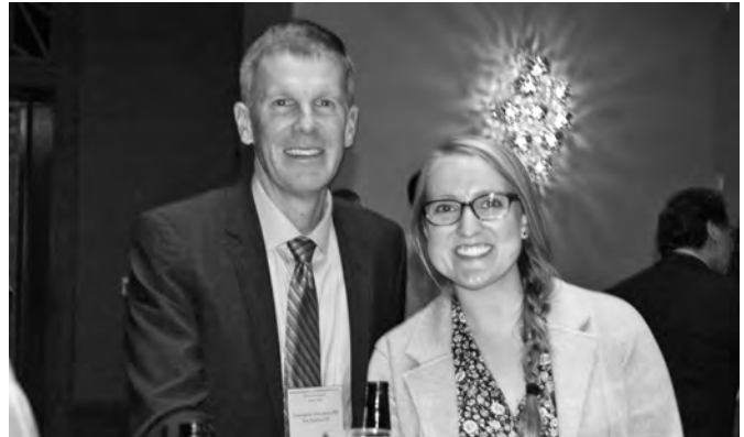
Unwinding at the Friday night reception for all attendees