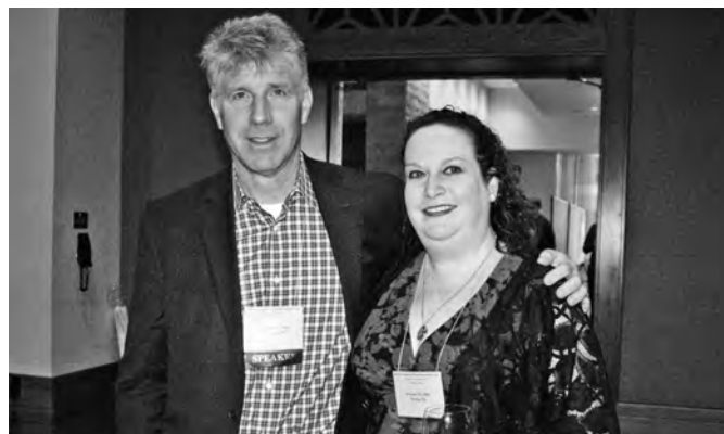
Attendees enjoy the Thursday night ADFPF reception