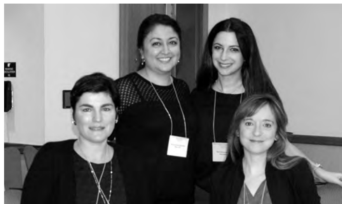
ECP's: The future of AAPL