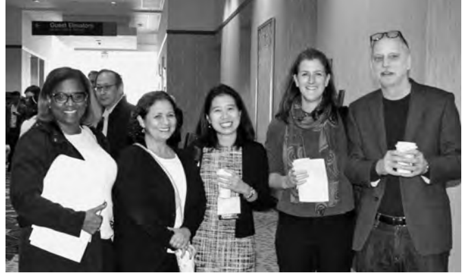
Catching up with colleagues