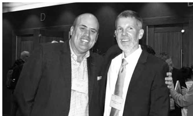
Catching up with colleagues