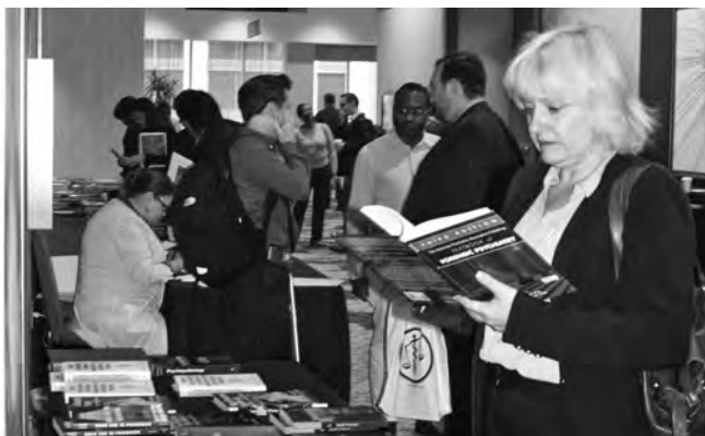
The latest forensic psychiatry books on sale. Which to choose?