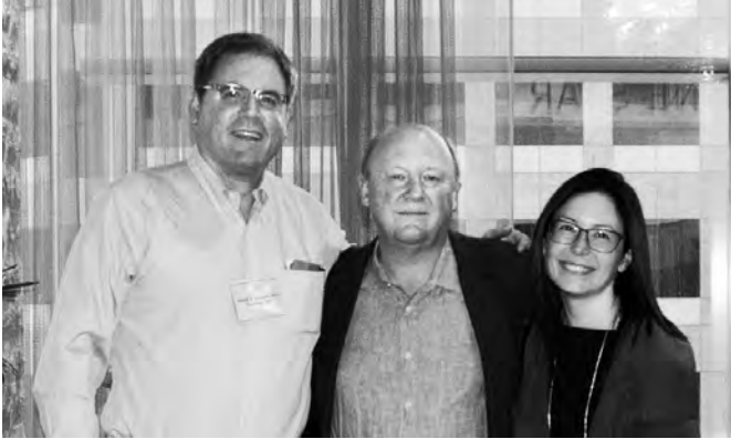
Catching up with colleagues