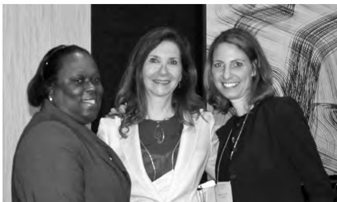
Catching up with colleagues