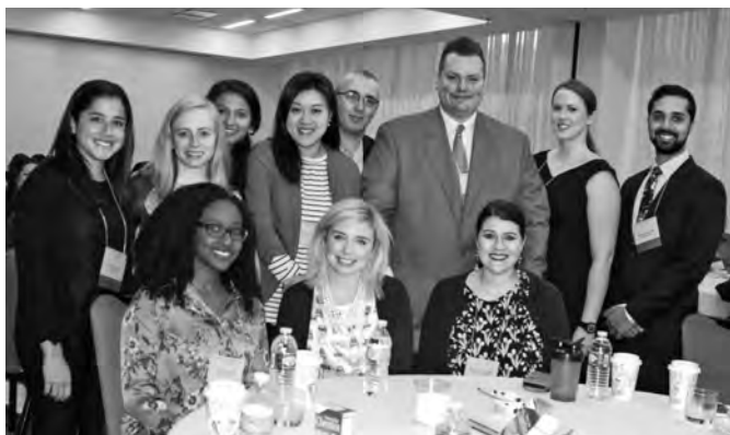
ECP's: The future of AAPL