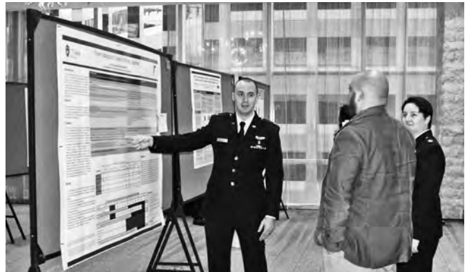
Attendees engage with a poster presenter