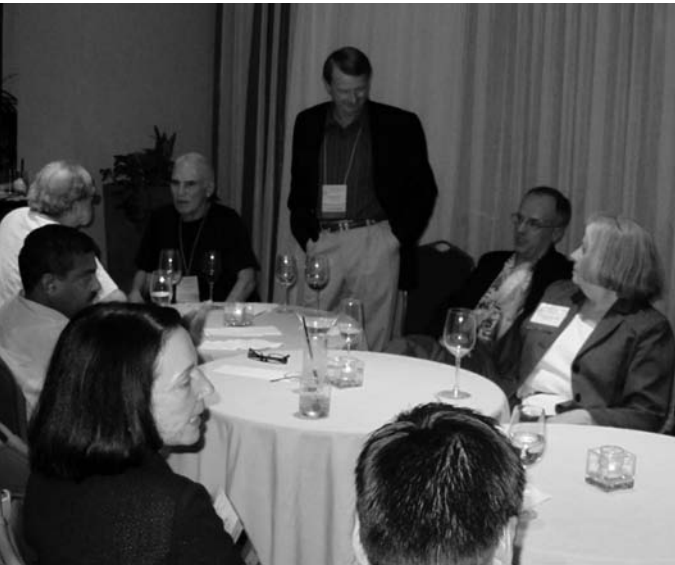
AAPL Institute reception.