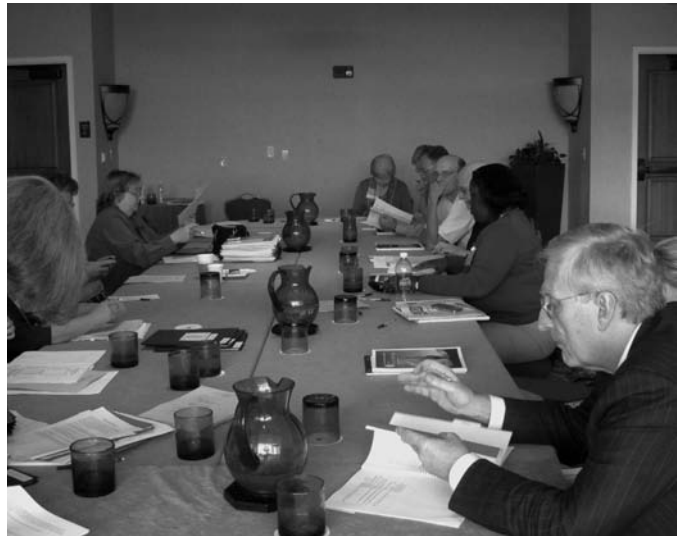
Education Committee: Focused on educational content of presentations.