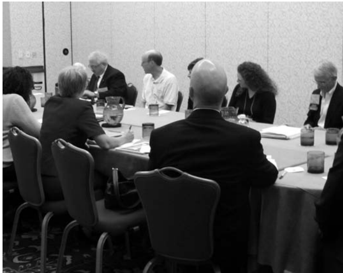
Institutional and Correctional Committee: Reviewing practice issues in unique settings.