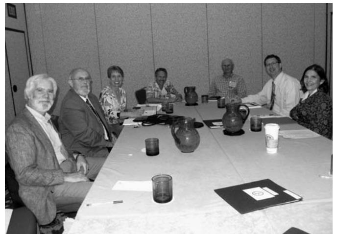
Private Practice Committee: Embraces an opportunity to rub minds and shoulders with colleagues.