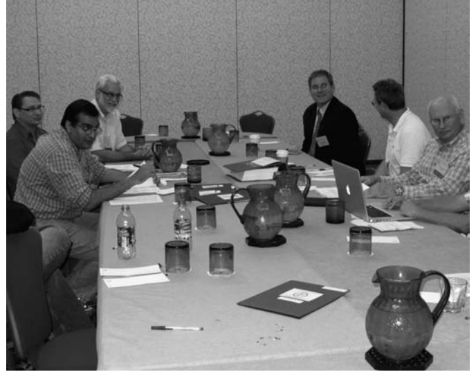
Forensic Neuroscience Committee: Is the future here?