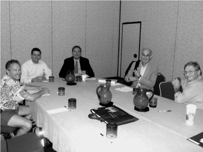
Computers Committee: Generating ideas about usefulness of computers in forensic psychiatry.