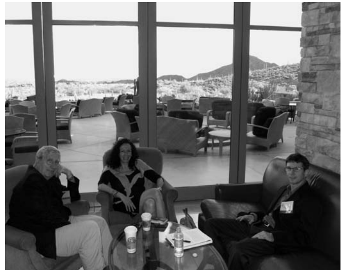
Relax, enjoy the alluring atmosphere...until the next presentation.