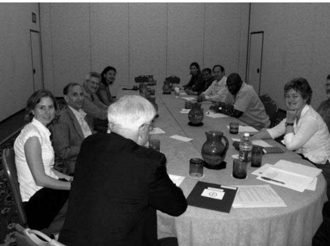
International Relations Committee: What's new around the world?