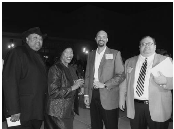
At the Attendees' Reception.