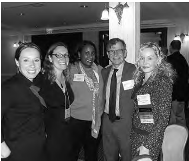
Getting together at the committee dinner.