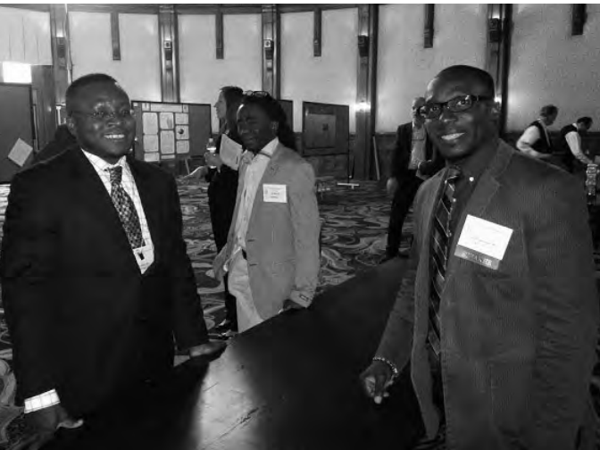
Colligiaty during a poster session.